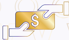
PROPERTY SALE PRICE