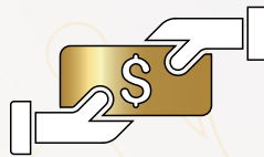
PROPERTY SALE PRICE