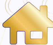
MLS LISTING NUMBER